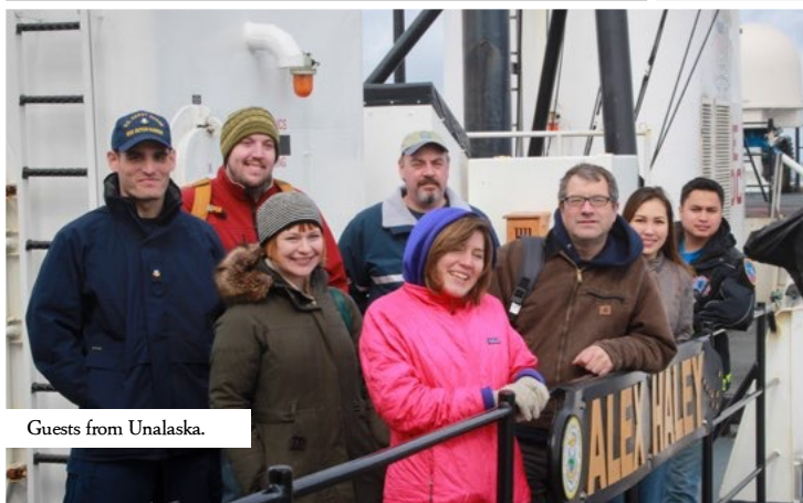
Guests from Unalaska.