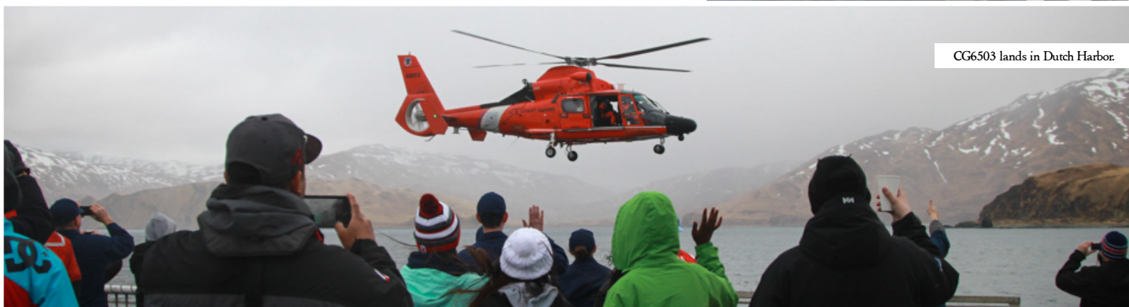
CG6503 lands in Dutch Harbor.