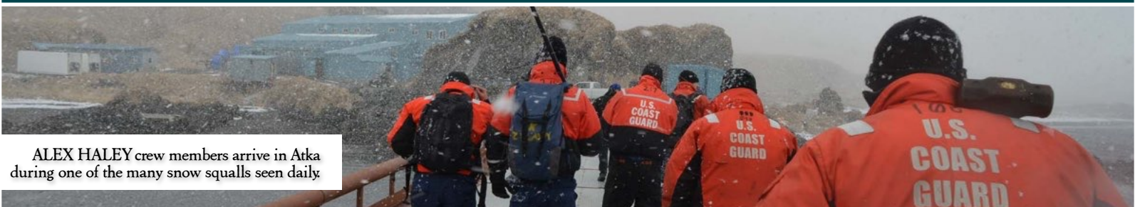
ALEX HALEY crew members arrive in Atka during one of the many snow squalls seen daily