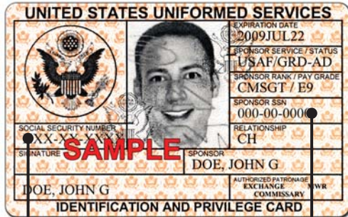
DD Form 1173

Dependent SSN will be replaced with XXX-XX-XXXX