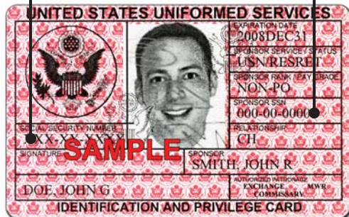
DD Form 1173-1