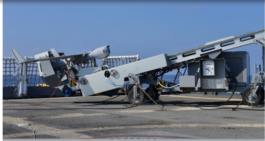
ScanEagle UAS deployed on Coast Guard Cutter Stratton. The ScanEagle UAS has a flight time of 18+ hours with a maximum speed of 96 miles per hour.