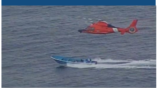
Imagery from the unmanned aircraft system (UAS) deployed on Coast Guard Cutter Stratton.