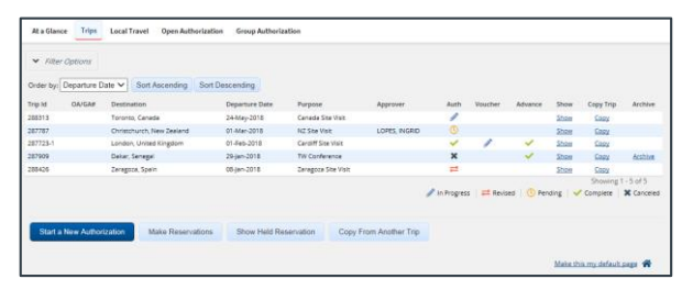
Figure 1: My E2 - Trips tab

TIP : Authorizations, vouchers, and advances can be accessed via the Trips tab.