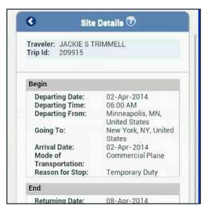
Figure 6: Mobile — Site Details page