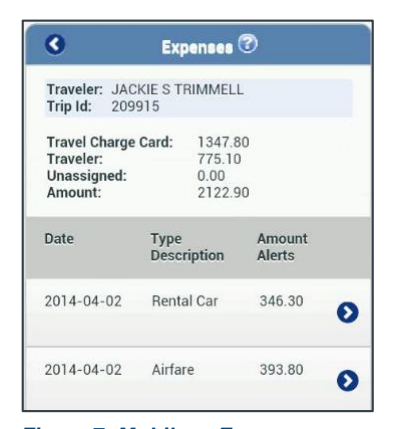
Figure 7: Mobile — Expenses page