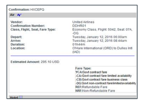
Figure 5: Mobile — Reservation information