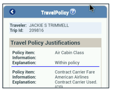
Figure 9: Mobile — Travel Policy page