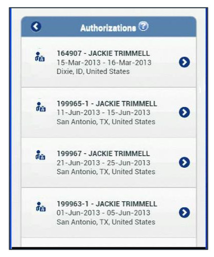
Figure 2: Mobile — Authorizations page

Tap a document type to view the list of specific documents of that type pending your approval.