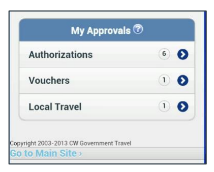
Figure 1: Mobile — My Approvals page

Log on to E2 via your mobile browser. After accepting the Warning Message and Privacy Act Notice, a My Approvals page displays.