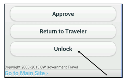
Figure 4: Mobile — Unlock button

If the Unlock button appears at the bottom of the page, the document is locked to you.