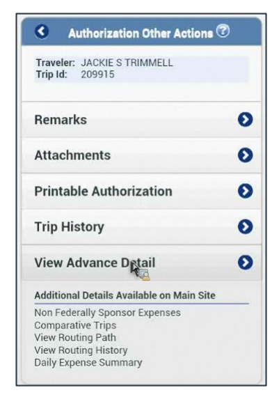
Figure 10: Mobile — Other Actions