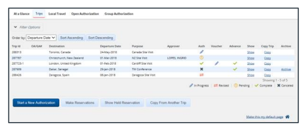
Figure 1: My E2 - Trips tab